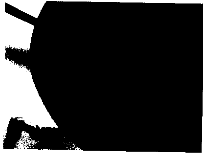
FIGURE 1: Prolapse of ileoanal J-pouch with straining, at initial visit.

(normal range: 40–80 mm Hg) and 45–65 mm Hg (normal range: 80–160 mm Hg), respectively.